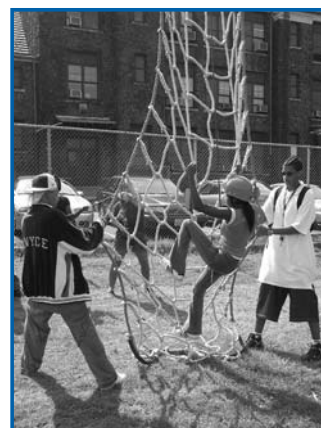
This cargo net was purchased through a SOMEF grant.