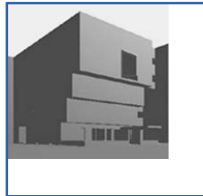
WHITNEY Whitney Museum of American Art

WOODCLIFF LAKE, NJ – In March 2001, this foundation approved a $25,000 grant to upgrade the facilities at the Dorchester Elementary School Library with new carpeting and state-of-the-art computer equipment. The Woodcliff Lake LEF also provides an annual $10,000 grant to the