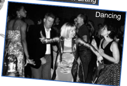
"Midnight at the Oasis"

the Whitney Museum of American Art. (see related article, page 2)