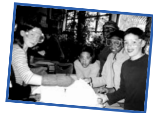
SOMS "Comet Chefs"