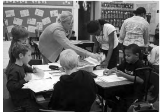
After school tutoring at Tuscan Elementary School.

"I like that we have our own peers teach us things about a subject we find difficult." CHS 10th grader